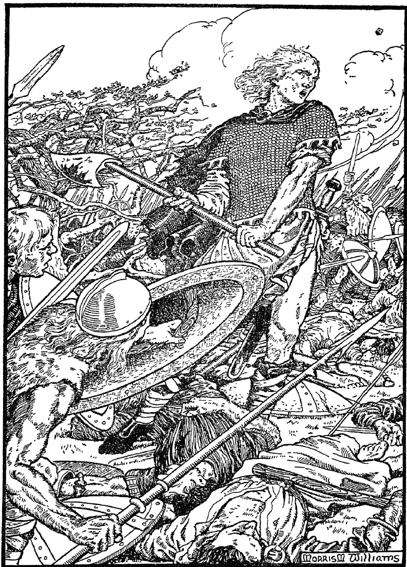
ALFRED AT ASHDOWN